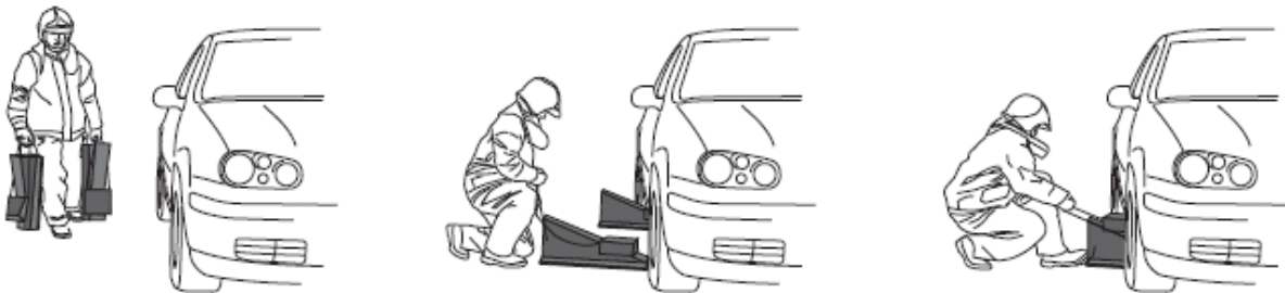
Vehicle stabilization: the rapid stair and saddle wedge gives you extreme speed and control. For extra fixation, use a wedge at the back – special grip pattern will hold wedge in place.

Each step chock had a strap added to the back for ease of removal and carrying. Please take note to the demonstration below.